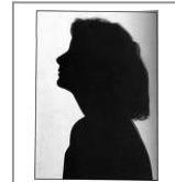
Bluestocking "Debbie Does Dewey"